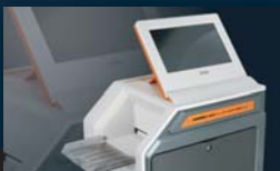
Compact and All-in-One Design

The Compact Integrated 6-inch Roll-Type Photo Station