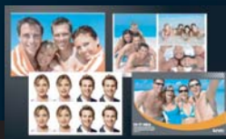
Variety of Photofinishing Layouts