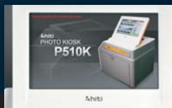
Intuitive User-Interface Design